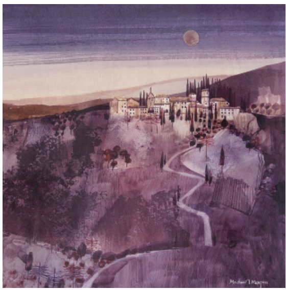
Tuscany Dawn 11.5 x 11.5in