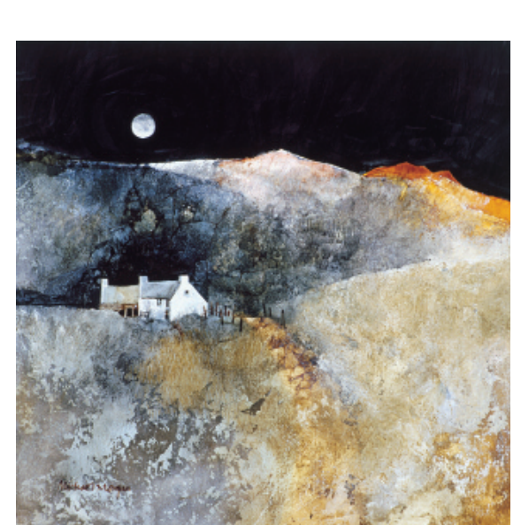
Rock Cottage 8.5 x 8.5 in